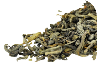
Jasmine Madam Butterfly

Delicate and smoky, this is a truly evocative tea with a rustic flavour and warmth that'll instantly transport you to magical campfires and wilderness.